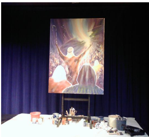
the finished painting from "Drawn to the Light"

Thanks to all the musicians who helped with special music for our Christmas Eve/Day worship services.