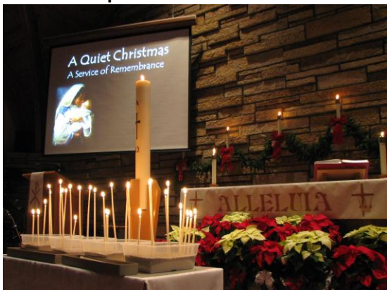
Quiet Christmas service on Wed. Dec. 21